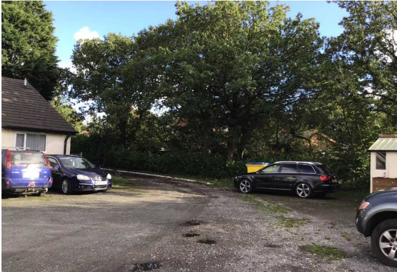
View of southern site boundary from rear of Hunters Lodge