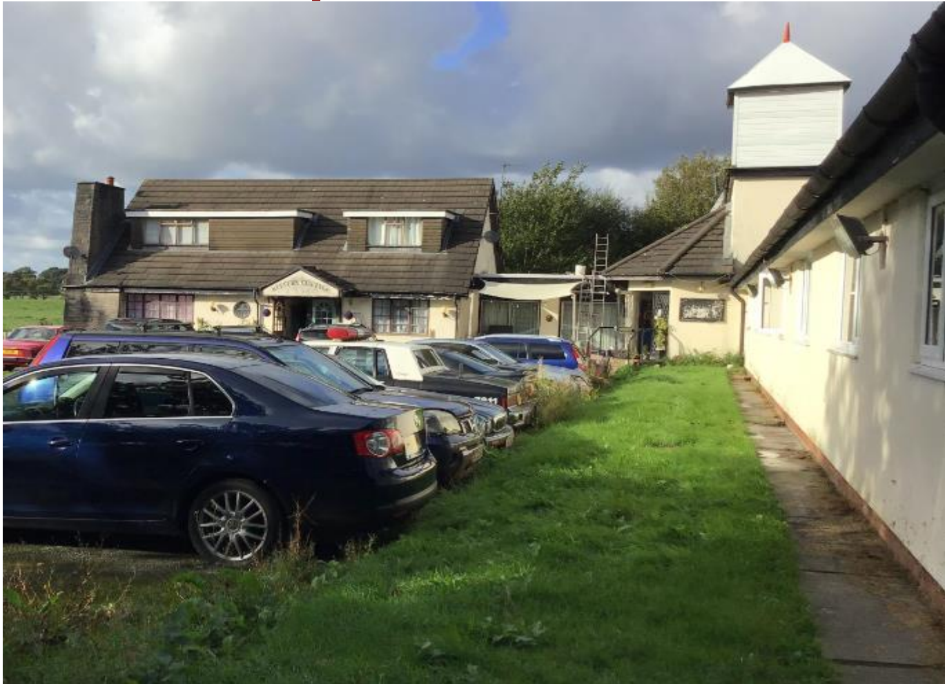
Rear of Hunters Lodge