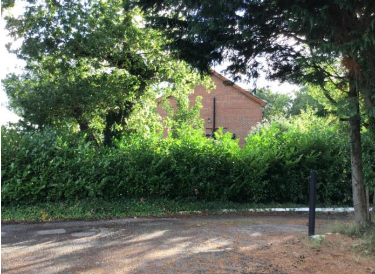
View to the south of The Oaks