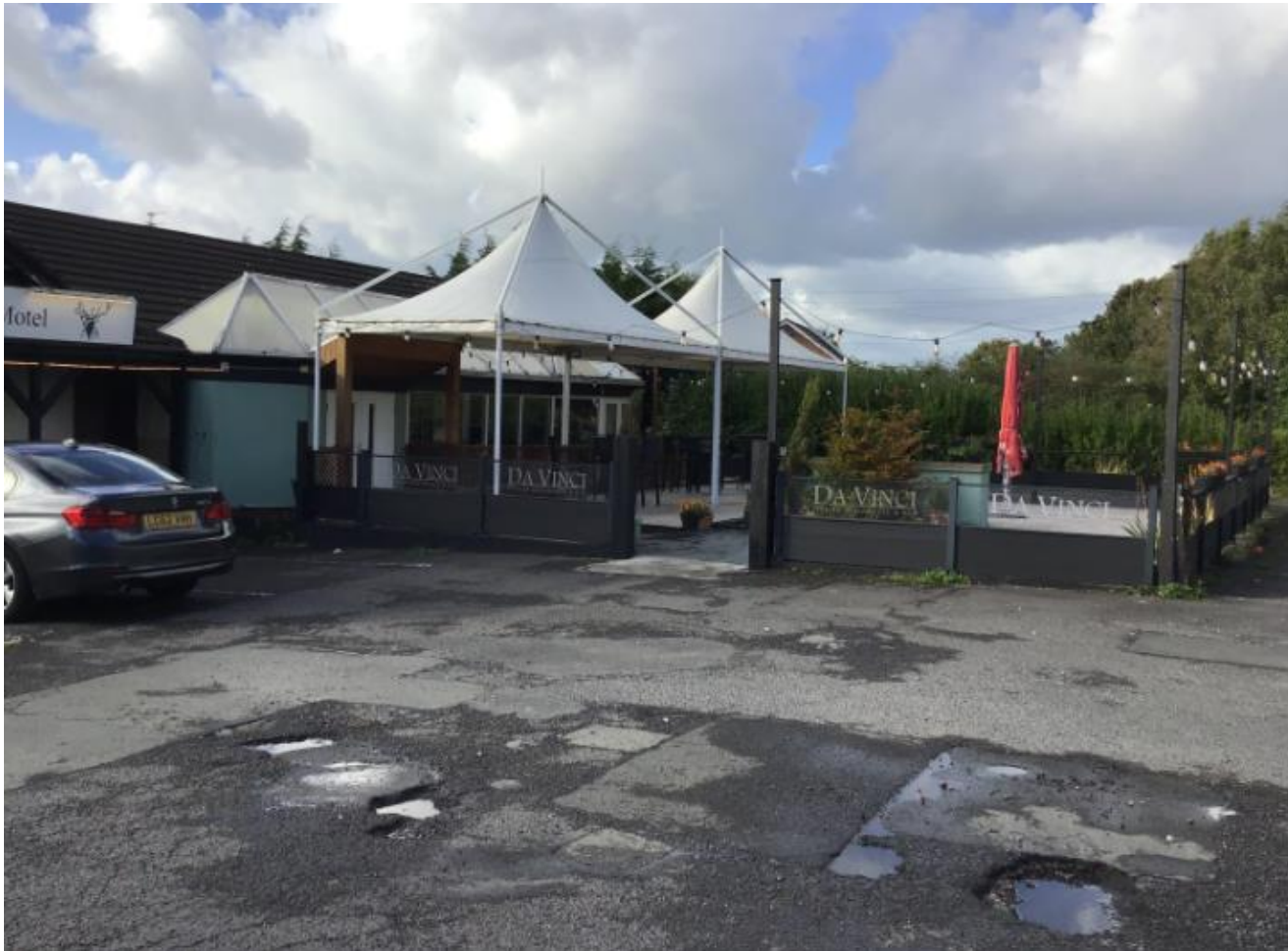
Da Vinci Restaurant